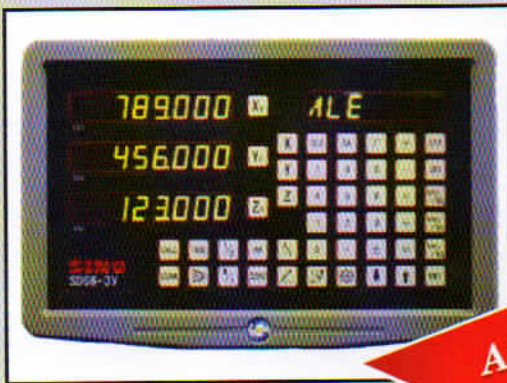
SINO THREE AXIS DISPLAY