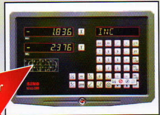
SINO TWO AXIS DISPLAY