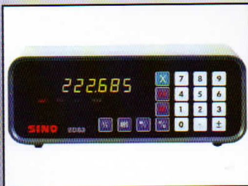
SINO SINGLE AXIS DISPLAY