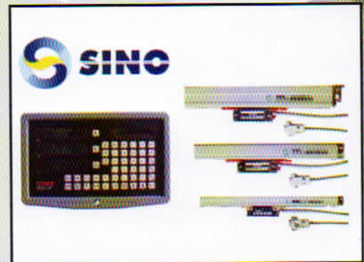
DISPLAY & LINEAR SCALE