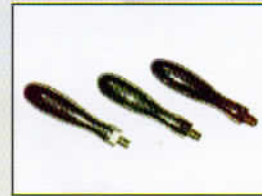
BALL LEVER HANDLE