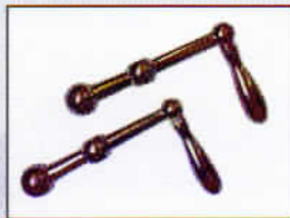
BALL CRANK HANDLE