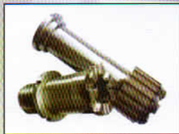
SPINDLE GEAR AND PULLEY HUB