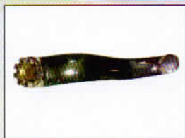
TABLE UP-DOWN HANDLE